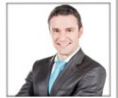
Featured by: Fox Business, CNBC, BIO, U.S. News & Wall Street Journal