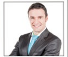
Featured by: Fox Business, CNBC, BIO, U.S. News & Wall Street Journal